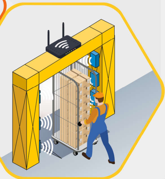
Technical gate for carts