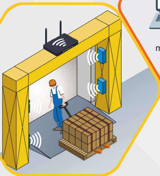
Technical gate for pallets